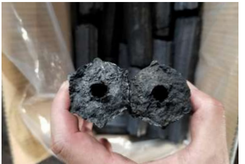
Made of Merbau, Ulin, Bengkirai, Sonokeling, Meranti hardwood.